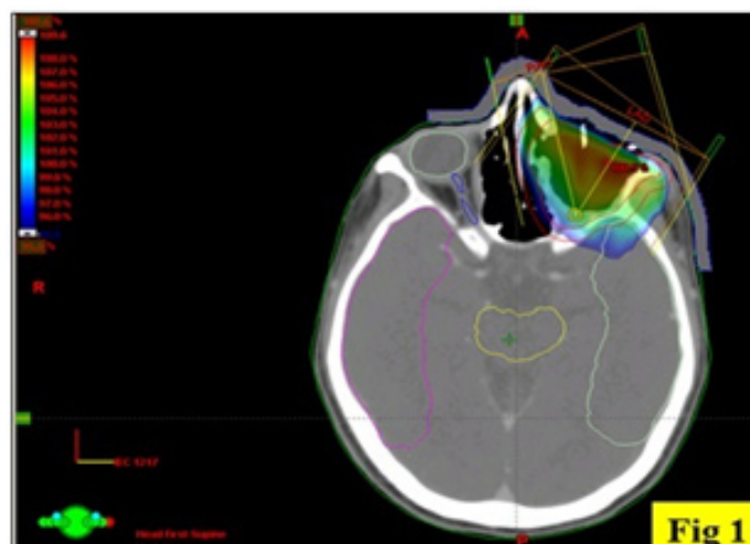
[Table/Fig-1]: Three-dimensional radiotherapy planning showing radiation portals and target volume

The interval between surgery and radiotherapy ranged from 2-18 months (median 3 months). Adjuvant radiotherapy was planned in one patient after re-excision following recurrent disease hence the gap between initial surgery and adjuvant radiotherapy. Normally adjuvant radiotherapy is planned between 6-8 weeks if wound has healed and is suitable for radiotherapy. It sometimes gets delayed for various reasons including long waiting time in our institute and patient compliance Radiotherapy dose ranged from 30-60Gy. A median postoperative radiotherapy dose was 60 Gy. During radiotherapy all patients developed grade 1-2 skin reaction. Four patients developed grade 2 conjunctival reactions as per RTOG